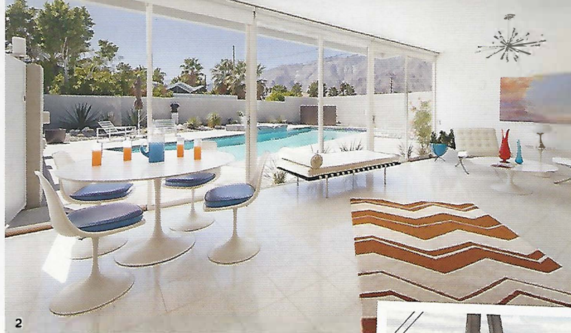
1 The Galleria is a trove of new and vintage finds. 2 An in-depth look at the local architecture from The Modern Tour. 3 Bird's-eye views from the Aerial Tramway.